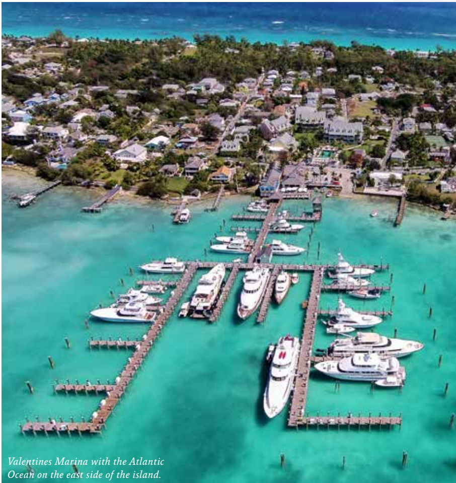
Valentines Marina with the Atlantic Ocean on the east side of the island.